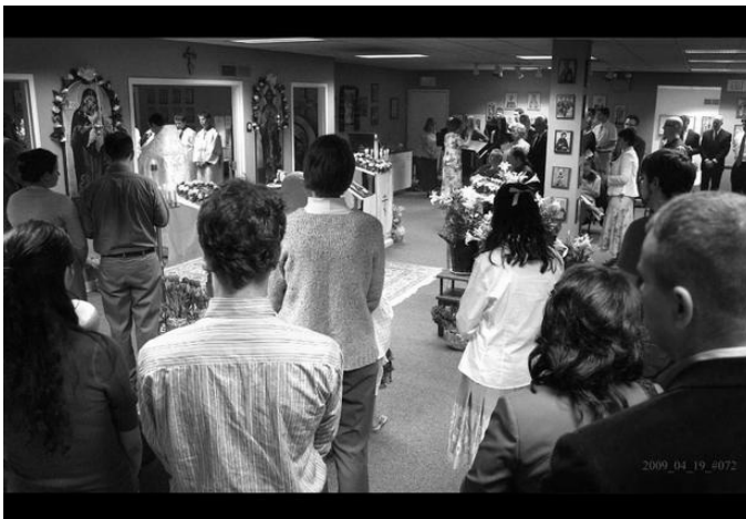
Holy Pascha 2009